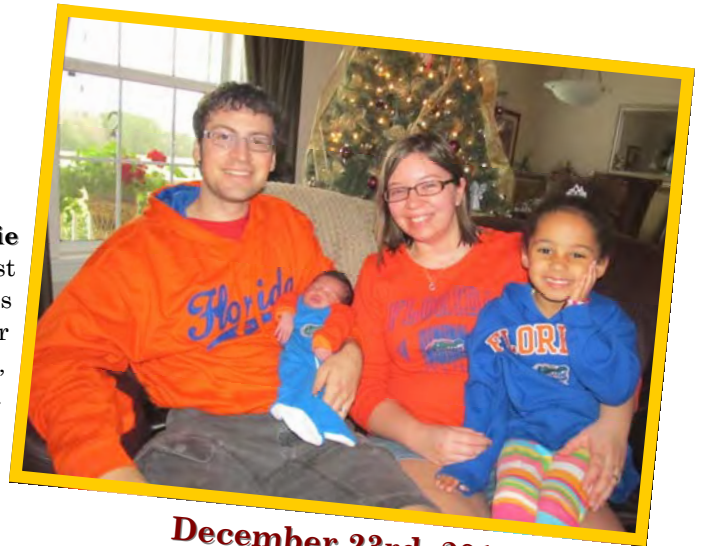
December 23rd, 2011