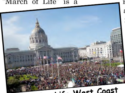
Walk For Life West Coast

In 1984 President Ronald Reagan instituted the first National Sanctity of Human Life Day, a day dedicated to praying for an end to abortion. Since that time, this annual event has been commemorated on the third Sunday of January by hundreds of thousands of Americans. The “March of Life” is a