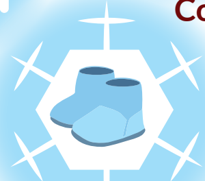
CFS baby boy