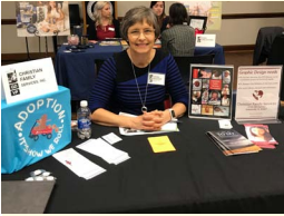
This was the first time we attended Santa Fe College Graphic Design's networking event, Gainesville. Two students Interned with CFS following the event.(Left)

Do you know of an event we can attend to share CFS with others? Contact CFS so we can add the event to our calendar!