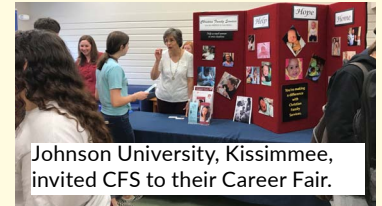
Johnson University, Kissimmee, invited CFS to their Career Fair.