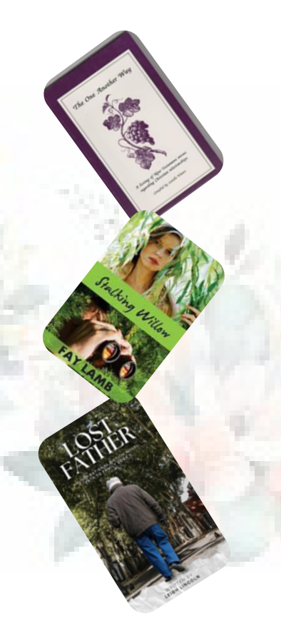
Click the books to view the authors and there works

Thank you to ALL donors for gifts you give from your talents to CFS.